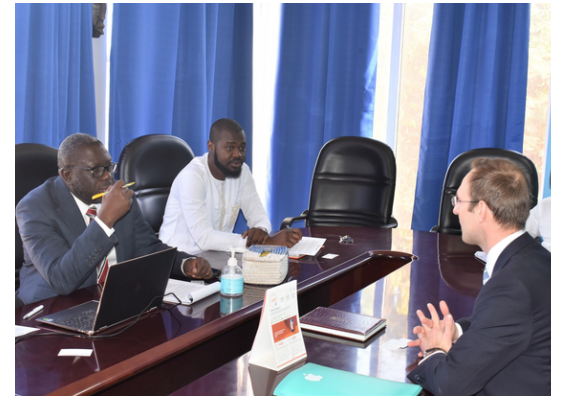
The World Bank Business Ready Project mission in The Gambia meets the GCCI President