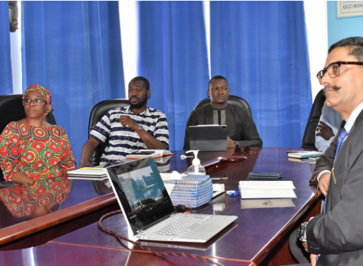
Meeting with Shapoorji Pallonji Construction for the initial scoping of the Jula City Project.